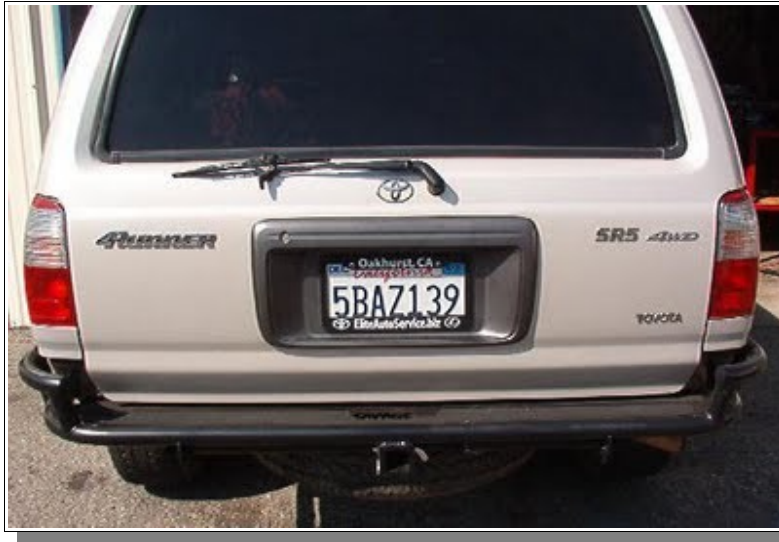
New tube bumper installed.