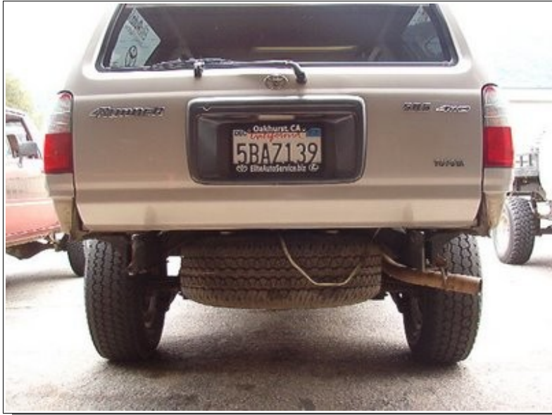
Rear bumper removed.