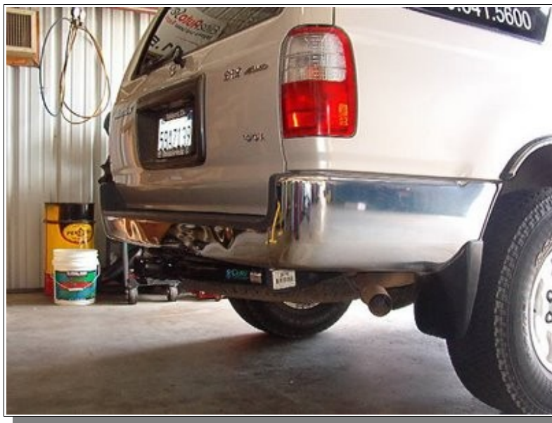
Stock rear bumper - note how far down the hitch and spare tire are.