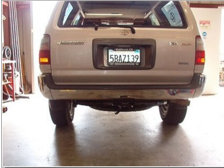
Stock rear bumper with hitch