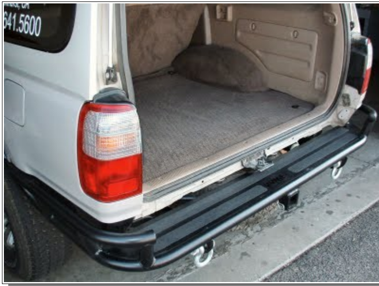
Rear deck. Note that grip tape has been installed (included with order).