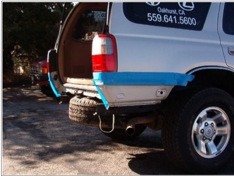
Masking body for painting.